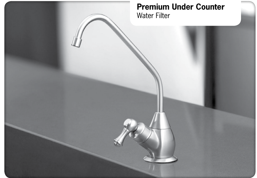
Premium Under Counter Water Filter